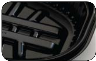
A reservoir in the unit's base draws excess liquid away from the bird.